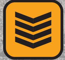
Military grade quality